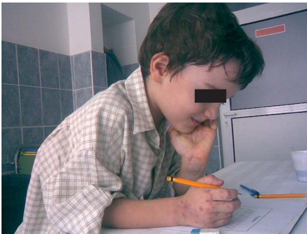
Figure 2. Grouped petechiae on the dorsal aspects of the right hand

low serum complement fraction C3 of 38 mg/dL (normal values: 55-120 mg/dL). Serum immunoglobulins concentrations were normal. Circulating immune complexes: 64 IU (normal values: < 70). The patient received Ceftriaxone IV during the next 30 days, followed by azithromycin for 5 days. ESR was normal, but a remarkable transitory leukopenia (1690/cmm) with severe neutropenia was noted (13.2% = 223/cmm). At this stage of the disease the patient was transferred to our department of rheumatology. He appeared to be in a good state of nutrition with a weight of 22 kg and a height of 110 cm. The first clinical impression suggested Henoch-Schönlein purpura (HSP), but this was ruled out due to the six months of persistent non-palpable petechial purpura, without any signs of articular, abdominal or urinary involvement. Laboratory data reconfirmed normal CBC, acute phase reactants,