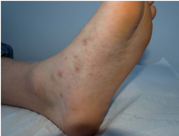
Figure 1. Discrete and grouped petechiae and subtle purpuric papules forming poorly circumscribed red-brown patches on the feet and lower legs