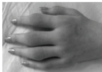
Figure 3. DG 17 yo, 2008: Active arthritis of proximal interphalangeal and metacarpophalangeal joints

Polycyclic evolution of the systemic arthritis involves relapses, sometimes for long periods of